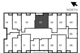
FLOORS 2-5, SUITE 01

Dimensions, specifications, layouts (including but not limited to tile patterns), window sizes, mullions, fixture representation, appliance and fixture locations, and materials are approximate only, may vary, and are subject to changes without notice as provided in the Agreement of Purchase and Sale. Plans may be reversed. Wall thickness will vary with floor levels reducing room dimensions accordingly. Actual usable floor space may vary from the stated floor area. Measurements of rooms set forth on any floor plan are generally taken at the greatest points of each given room and centre line of windows (as if the room were perfectly rectangular). Furniture is not included. Furniture shown on terrace spaces should be secured for safety. Prices are subject to change without notice. E. & O.E. Plans are not to scale. For more information on the method used for calculating floor area of any unit, reference should be made to Builder Bulletin NO. 22 published by Tarion.