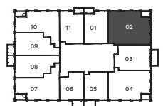
FLOORS 10-25, SUITE 02 LPH, PH, UPH, SUITE 02

layouts (including but not limited to tile patterns), window sizes, mullions, fixture representation, appliance and fixtures are approximate only, may vary, and are subject to changes without notice as provided in the Agreement of Purchase and Sale. Wall thickness will vary with floor levels reducing room dimensions accordingly. Actual usable floor area is less than the total floor area. Measurements of rooms set forth on any floor plan are generally taken at the greatest points of measurement (i.e. line of windows (as if the room were perfectly rectangular). Furniture is not included. Furniture shown on terrace is for safety. Prices are subject to change without notice. E. & O.E. Plans are not to scale. For more information on the total floor area of any unit, reference should be made to Builder Bulletin NO. 22 published by Tarion.